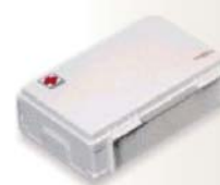
Box first aids kit Ref.: SZ-06 Code: 700110