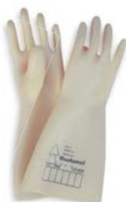
Dielectric gloves Ref.: SG-50 T-10 Code: 530160