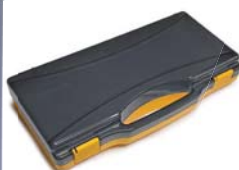
Plastic box for gloves Ref.: CGS Code: 545115