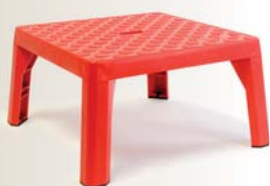
Insulating stool Ref.: ST-36 Code: 580100

Product supplied with screws and nails (for hanging).