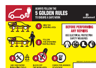
Code ES X725000 EN X725001 FR X725002