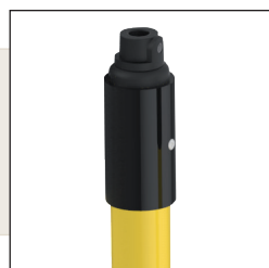
M Metric-10 Head