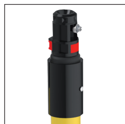
P Hexagonal + Metric Head

Stable adjusters Reinforced fibreglass tube Up to 12 m