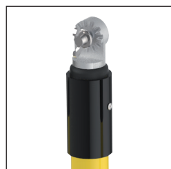
U Universal Head