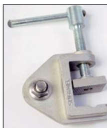
TT-38A Earthing lathe