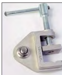
TT-38A Earthing lathe