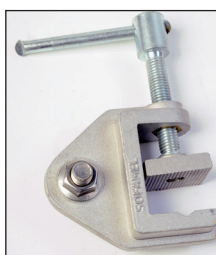
TT-38A Earthing lathe