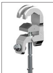
MPLE High voltage clamp