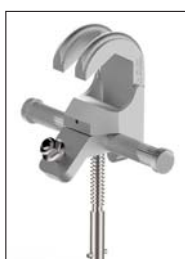
MPLP High voltage clamp