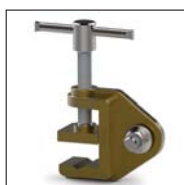
TT-38L Earthing lathe