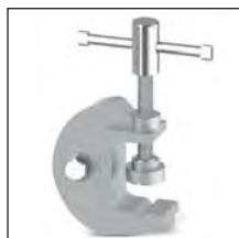
TT-50 Earthing lathe