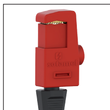
SHUNT SHCD and SHUNT SHPL Insulated earth clamps

Earthing and short-circuit kit for low-voltage distribution boards. The main reason for their installation is to protect the worker from accidental power-on or return of voltage during repair work. According to IEC 61230 standard.