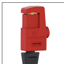
SHUNT SHCD and SHUNT SHPL Insulated earth clamps