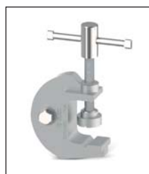
TT-50 Earthing lathe