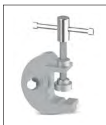
TT-50 Earthing lathe