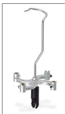
PP-4U Clamp dispenser