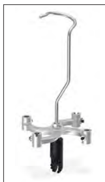
PP-4U Clamp dispenser