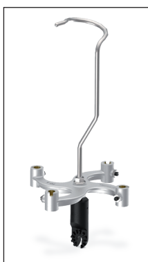
PP-4U Clamp dispenser