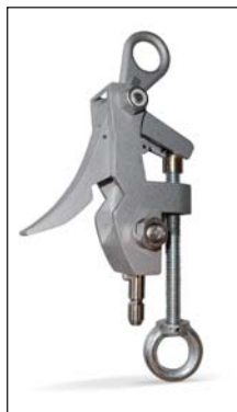
PCA-25 Medium voltage clamp