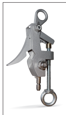
PCA-25 Medium voltage clamp