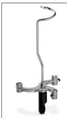
PP-3U Clamp dispenser