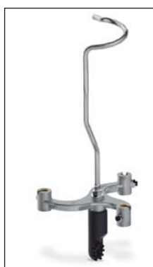
PP-3U Clamp dispenser