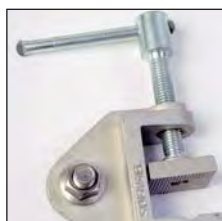
TT-38A Earthing lathe