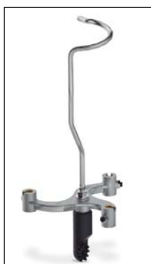
PP-3U Clamp dispenser