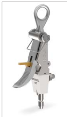
MC Medium voltage clamp