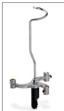
PP-3U Clamp dispenser