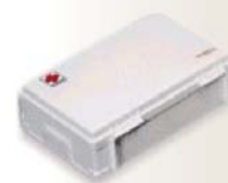
Box first aids kit Ref.: SZ-06 Code: 700110