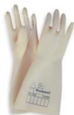
Dielectric gloves Ref.: SG-50 T-10 Code: 530160