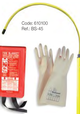
Code: 610100 Ref.: BS-45