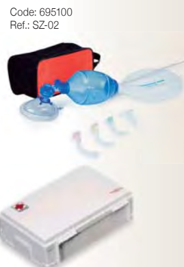
Code: 695100 Ref.: SZ-02