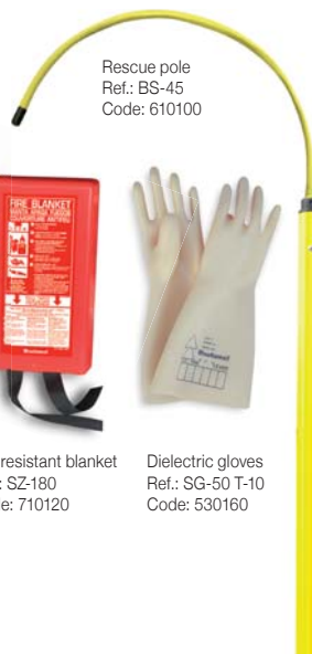
Rescue pole Ref.: BS-45 Code: 610100