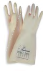
Code: 530160 Ref.: SG-50 T-10