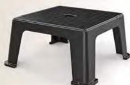
Code: 580155 Ref.: STM-45

* For other configurations, please inquire.