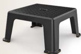
Insulating stool Ref.: STM-45 Code: 580155

Product supplied with screws and nails (for hanging).