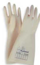
Dielectric gloves Ref.: SG-50 T-10 Code: 530160