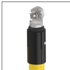
U Cabezal Universal