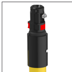
P Cabezal Polivalente (Hexagonal + Métrico-10)