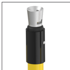
B Cabezal Bayoneta